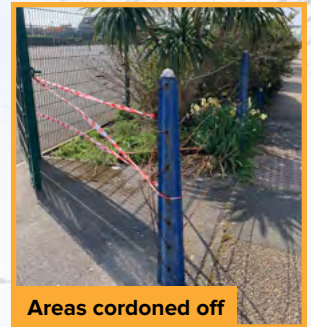
Areas cordoned off