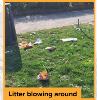
Litter blowing around