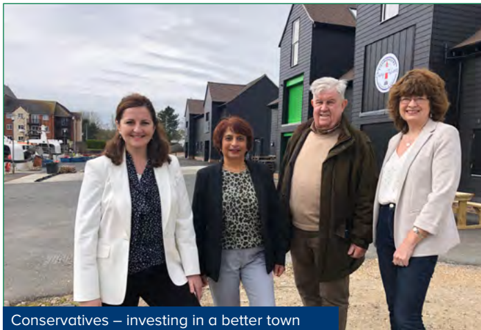
Conservatives – investing in a better town

A raft of Conservative-led grants has helped our new quay area in the marina to become a vibrant, multi-purpose zone combining a sustainable local fishing industry with a heritage visitor destination.