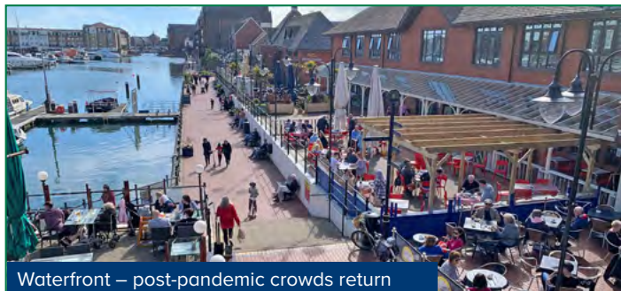
Waterfront – post-pandemic crowds return

O UR WONDERFUL Waterfront cafés, restaurants and other businesses are returning to normal as we emerge from the pandemic. The area is busy again and it is great to see so much life return to support these